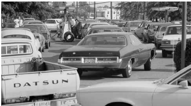
United States' support of Israel during the Arab-Israeli War led to an oil embargo. As a result, Americans experienced a gasoline shortage that led to rationing and an economic crisis relating to high prices, 1973.

Consider the history of the Middle East. One example was the creation of the State of Israel in 1948. How were diplomatic relationships carried out in the area? What role did the United States and Great Britain play? What were the long-term consequences for Israel? For diplomacy in the region? Or, students might be curious about the 1973 Arab-Israeli War and subsequent peace negotiations. What happened, and how did it impact the United States and other nations? What effect did these diplomatic relations have on the world economy?