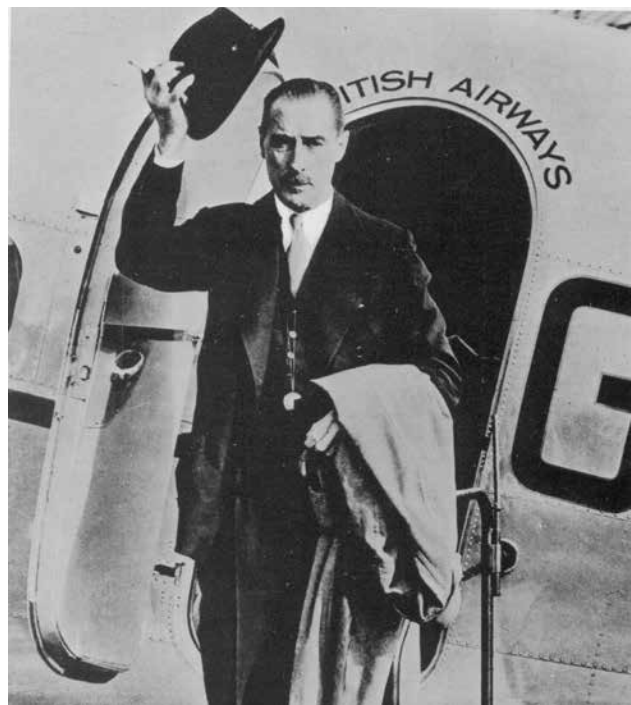
Neville Henderson, the British Ambassador to Germany, departing Croydon Airport to fly to Berlin, Germany, August 1939.

Others might look at how New Zealand established itself as a diplomatic force during World War II and its active involvement in building the United Nations (1945). Before World War II, New Zealand maintained only one foreign outpost in London, England. What changed for New Zealand? What new alliances did New Zealand establish? How did treaties involving New Zealand, such as the ANZUS (Australia, New Zealand, United States) Defence Treaty in 1951 and SEATO (Southeast Asia Treaty Organization) in 1954, influence New Zealand's status as a world power? Why did New Zealand seek to establish relationships with the United States, Canada, and Asian countries?