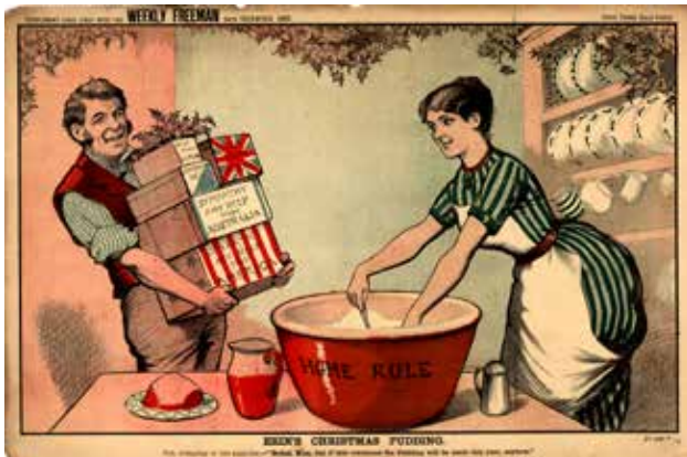
Erin's Christmas Pudding appeared in the December 24, 1887, issue of the Weekly Freeman magazine and showed international support to Ireland and the concept of Home Rule.

Think about how countries have interacted with each other. For instance, students might explore the heated debate between Ireland and Great Britain over the concept of Home Rule (1870–1919). Why was self-government important to the Irish? What debates occurred between Ireland and Great Britain due to this political movement? Did the debates lead to diplomacy on both sides? How was this debate viewed internationally? What were the short-term and long-term consequences?