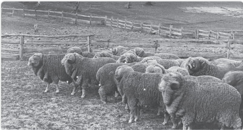
Flock of merino rams, with post and rail fencing in the background, Australia, ca. 1886

With respect to wool production, Britain had (or would very soon have) at its command the vast sheep walks of Australia. The establishment of the merino breed mirrored the naturalization of sheep in Australia more broadly. The first sheep were introduced to the great southern continent in 1788, but only twenty-eight survived. By 1810, however, the colony's flock stood at more than 33,000 sheep. 49 Similarly, merinos were first introduced in 1796, and by the 1820s these were well established as a "stud flock" serving the colony of New South Wales. 50 Although the Australian ecosystem had evolved without any endemic ovines, within only a few decades of European "discovery" and subsequent settlement, the island continent boasted a booming sheep industry in which the merino constituted the backbone of colonial flocks and the basis for its profits. 51 As an extremophile breed, merinos flourish in very hot or very cold conditions, but tend to languish in temperate climates. In Australia, where the hot, dry climate of most of the continent contributed to the production of a very fine-wooled type of merino, the breed thrived beyond expectation. Herded in vast flocks that soon surpassed in numbers their Spanish ancestors, these colonial sheep provided fleeces in the quantities necessary to fuel British industry. 52